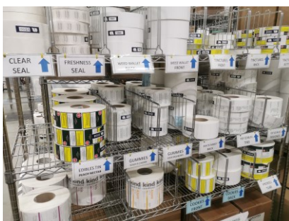
The Label room was improved with 5S to streamline the materials replenishment

We developed a 2-session 2-hours Kanban training program for managers and supervisors. We analyzed the historical demand for the 23 packaging materials used in 7 production lines, from shrink wrap, corner posts and tape to box labels. Based on the demand, we calculated the kanban “signals” and added a safety buffer.